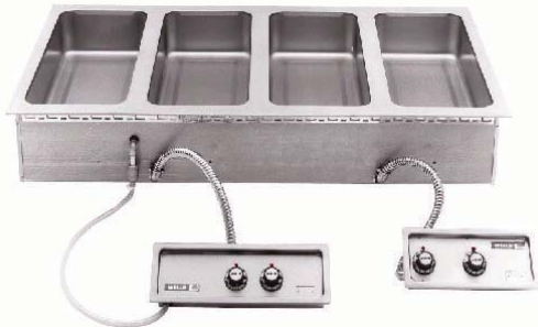
MOD400TDMAF with dual control panels