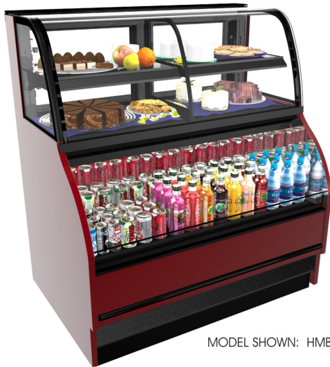
MODEL SHOWN: HMBC4

NOTE: NON-DIVIDED UPPER DISPLAY AREA - HMBC2 & HMBC3 DIVIDED UPPER DISPLAY AREA - HMBC4, HMBC5 & HMBC6