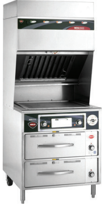
Model WVG136RW SHOWN